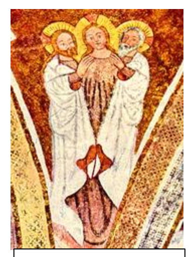
Early Christian depiction of the Trinity

Spirit gives us faith. Meanwhile, however, we have to realize that mind is limited and cannot grasp God. However when people have tried to explain the incomprehensible logically, one has often gone too far. These misunderstandings have usually gone too far in two very different directions. One direction divorced God the Father, Son and Holy Spirit from one another as if they were three different gods. The artwork in our text can easily give reason to think that there are actually three gods: a kind of polytheism.